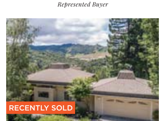
75 ESTATES DRIVE, ORINDA ////

3+ BEDS | 2.5 BATHS | OFFERED AT $1,550,000