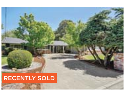
566 MERRIEWOOD DRIVE, LAFAYETTE

3 BEDS | 2 BATHS | OFFERED AT $1,095,000 Represented Seller