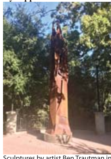
Sculptures by artist Ben Trautman in

downtown Lafayette. Photos provided Ato Lafayette's public art are emphasizes the idea that trees are some panels installed along a stone full of tubes and structures that wall under a walk way leading into move water from the ground and the Town Center III condomini- air. These abstract pieces will work ums, behind Panda Express and to in dialog with the trunk sculpture the south of the walkway leading to the BART station. It is easy to miss