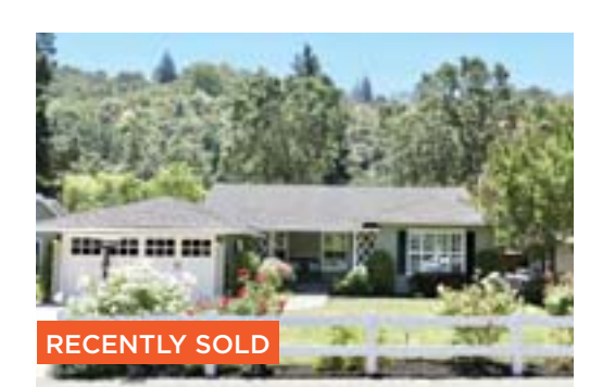
3423 FREEMAN ROAD, WALNUT CREEK

5 BEDS | 4 BATHS | OFFERED AT $1,695,000 Represented Buyer