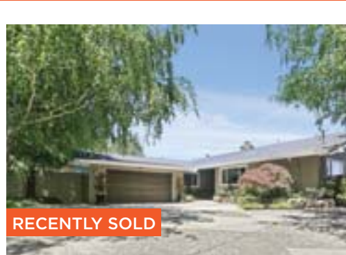
1024 AMENO COURT, LAFAYETTE

3+ BEDS | 2.5 BATHS | OFFERED AT $1,550,000